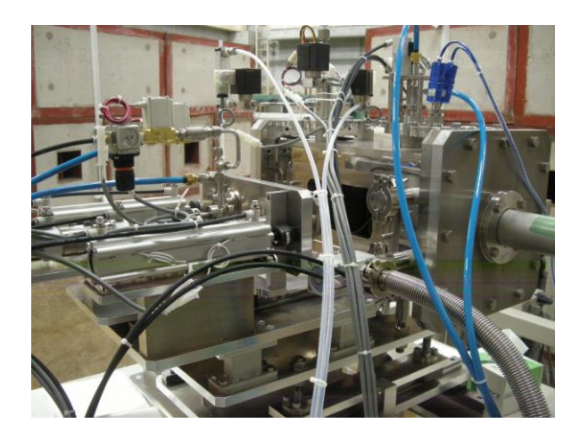
Figure 2: Irradiation chamber for RI production placed at the end of Fcourse in M-exp. room.

Figure 1: Collaboration scheme for the joint research on the targeted alpha therapy at Osaka University.